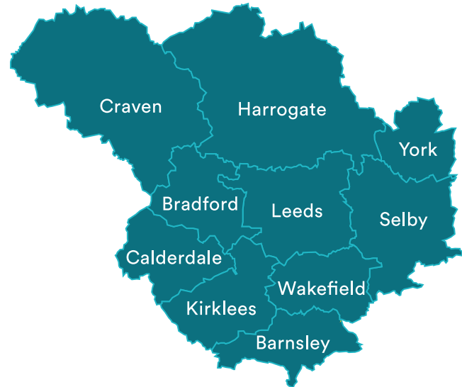
This is a map of Leeds City Region