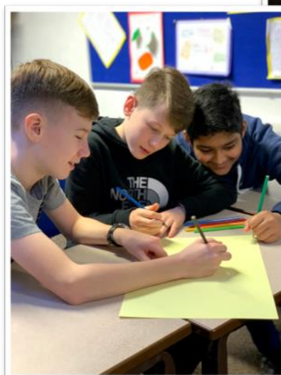
Some of our Y9 students taking part in the huge range of activities provided at the Health Fair Day