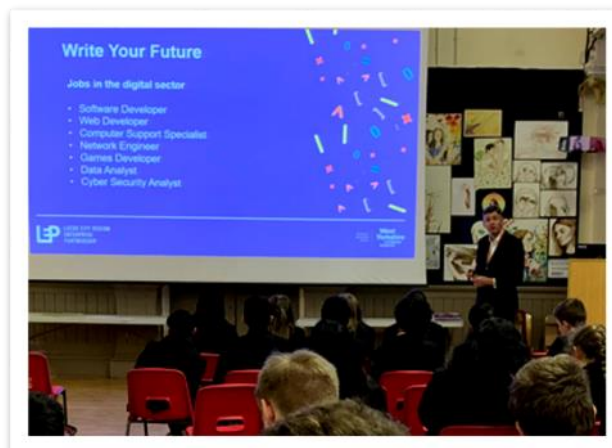
Some of our Y8 students taking part in the huge range of activities provided at the Careers Day

A further afternoon session looked at Future Labour Market information to discuss which industries may grow in our area in the future. This showed the students how many opportunities could be coming up, for example, the fact that over the next 5 years, £250million will be invested in the Leeds City Region's medical technology sector, resulting in more scientific and engineering jobs - an exciting prospect!