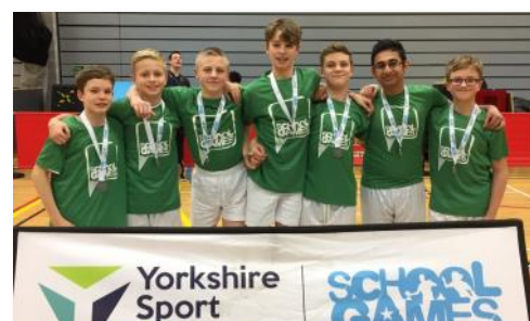
Sports News Page 8-9 Round-up of a busy term of fixtures and much sporting success.