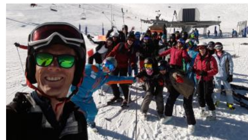
Andorra Ski Trip Page 2 Fun on the slopes for this year's intrepid thrill-seekers!