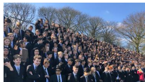
Whole School Photo Page 3 Gillman and Soame visit on a perfect day for our five-yearly photo.