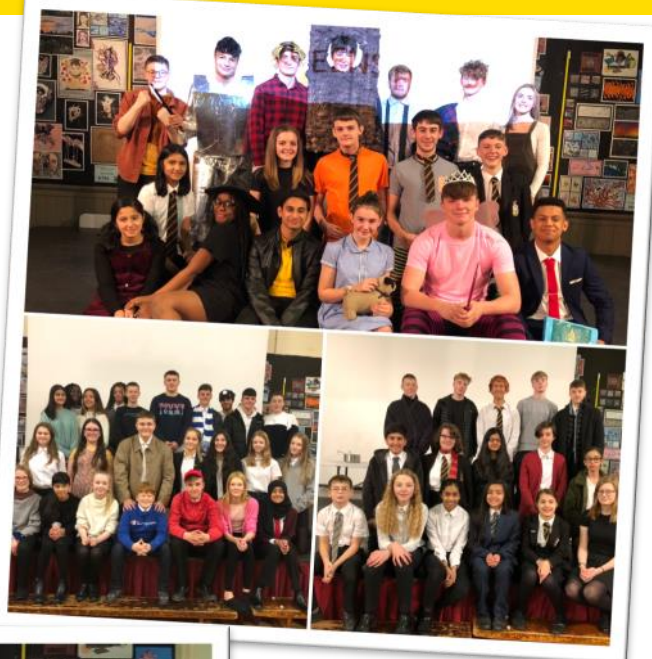
Clockwise from top: Queens "The Wizard of Oz", Kings "Harry Potter", Savile "Home Alone" Porter "Alice in Wonderland"

It was a tough competition but well done to Porter who took the best performance on the night. Thanks to absolutely everyone who took part and a huge well done to all the house officials who directed, coached and orchestrated the process. We couldn't have done it without you!